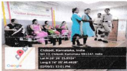
Demo by Police