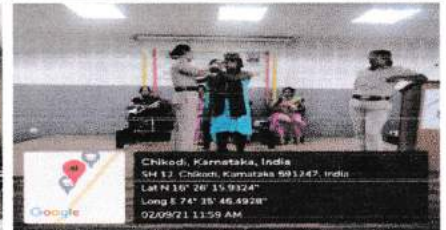
Practice by Students